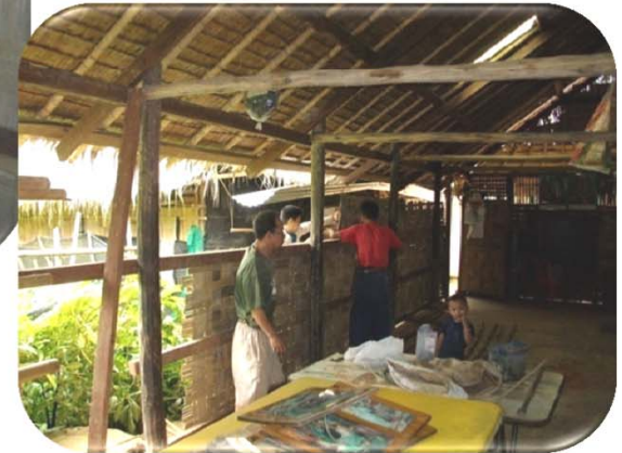
Repair of Ban Don Yang Church Building